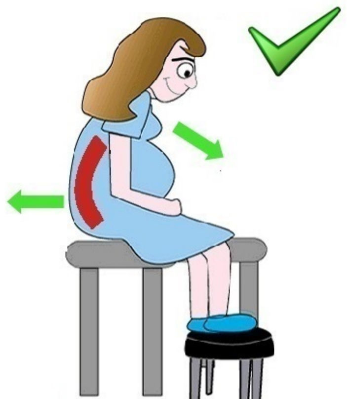
Sturmev, Chambers & McNamara